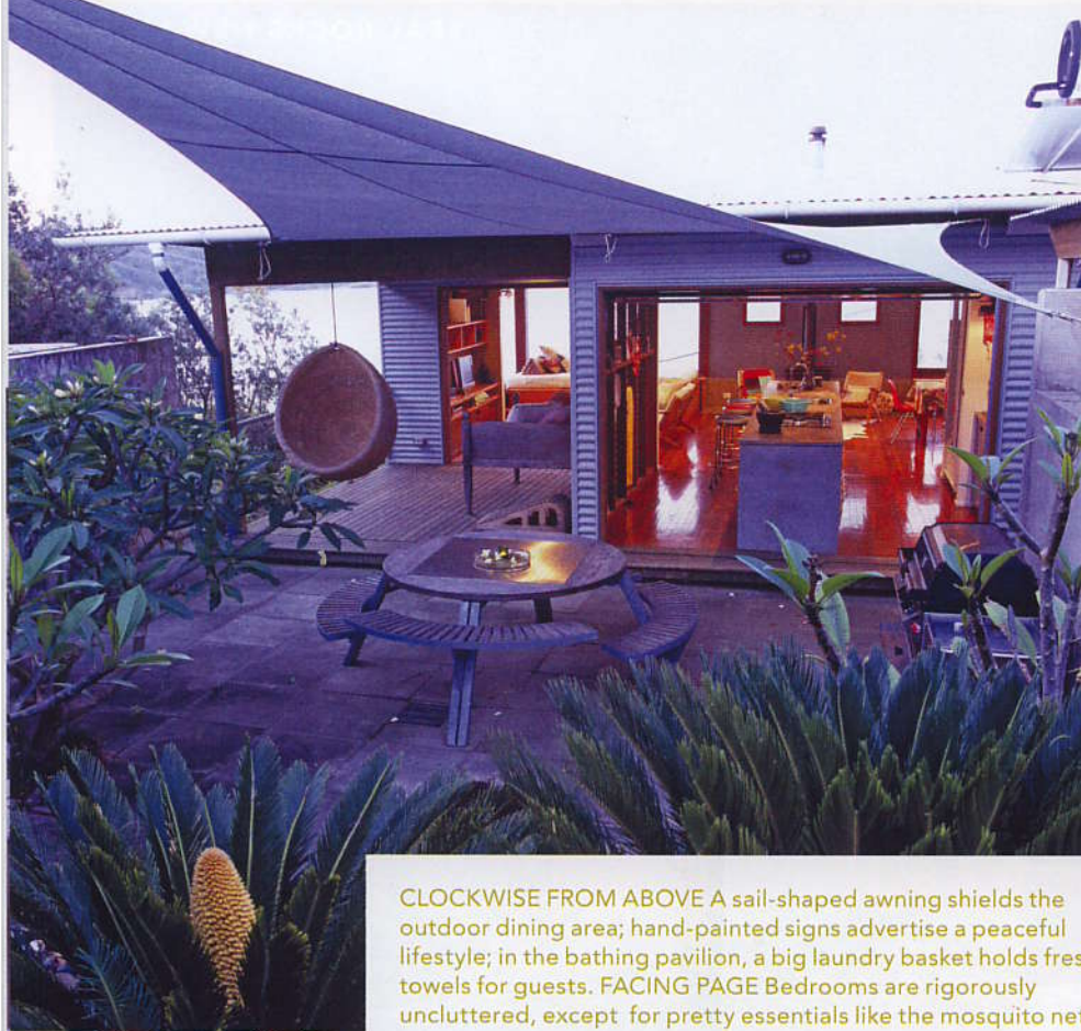
CLOCKWISE FROM ABOVE A sail-shaped awning shields the outdoor dining area; hand-painted signs advertise a peaceful lifestyle; in the bathing pavilion, a big laundry basket holds fresh towels for guests. FACING PAGE Bedrooms are rigorously uncluttered, except for pretty essentials like the mosquito net.