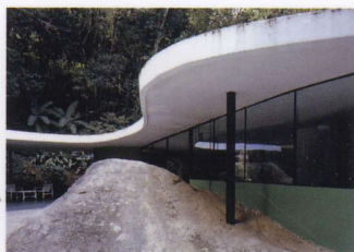
Oscar Niemeyer: Niemeyer House