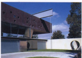
Rem Koolhaas/OMA: Maison à Bordeaux