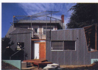
Frank O. Gehry: Gehry Residence