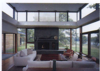
Tod Williams Billie Tsien: Rifkind Residence