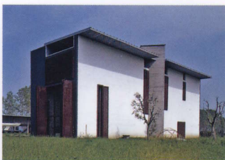
Tobia Scarpa: Scarpa House