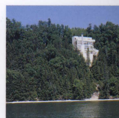
Richard Meier: Douglas House

Richard Meier Charles Gwathmey Michael Graves Peter Eisenman John Hejduk