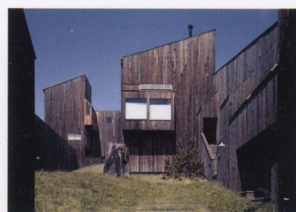
MLTW: Sea Ranch Condominium

Charles & Ray Eames Pierre Koenig Edward A. Killingsworth Craig Ellwood