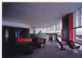
Will Bruder: Feigin Residence

Robert Stern Scogin Elam & Bray Tod Williams Billie Tsien Steven Holl