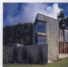
Sverre Fehn: Studio Holme

Alvar Aalto Ralph Erskine Jørn Utzon Sverre Fehn