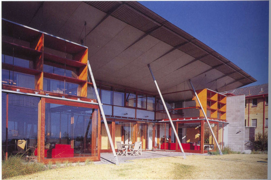
View from northeast: garden 北東より見る：庭