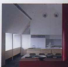
Glenn Murcutt: House in Southern Highlands