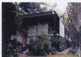
Charles & Ray Eames: Eames House and Studio